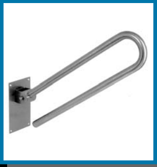
A 513 Swing Up Grab Bar Stainless stell.