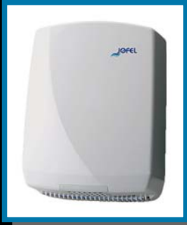
AA 14000 Automatic Hand Dryer Abs plastic cover, 2000w.