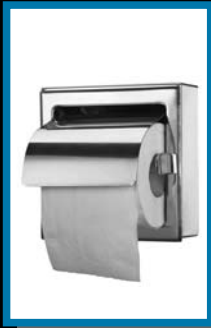
A 261 SM Toilet Tissue Disp. With cover, Surface mounted, Stainless stell.