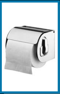
ST 225 Toilet Tissue Disp. With cover, Surface mounted, Stainless stell.