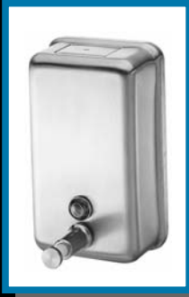
A 605 Soap Dispenser With lock&key, Stainless Stell.