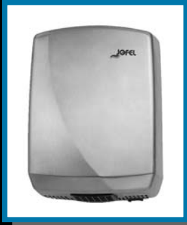
AA 16500 Automatic Hand Dryer Stainless stell cover, 2000w.