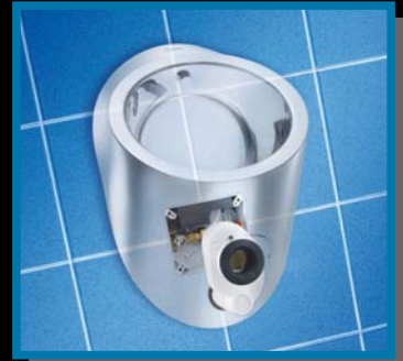
INSIDE STEEL Radar System Urinal Complet System Stainless stell.