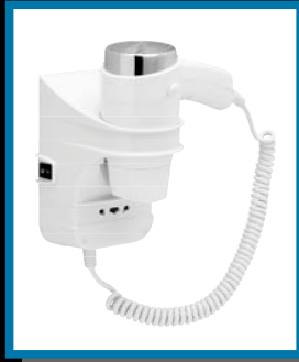
CLIPPER PR Wall-Mounted Hairdryer With shaver socket, 1600w.