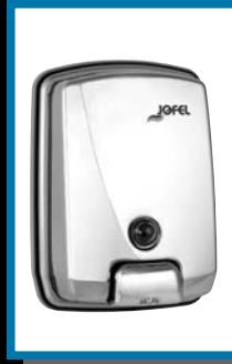
AC 54500 Soap Dispenser With lock&key, Stainless Stell.