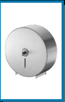
AE 21000 Jumbo Roll Toilet Tissue Disp. With lock&key, ø:273mm., S.stell.