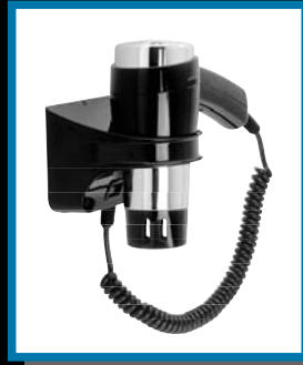
CLIPPER B Wall-Mounted Hairdryer Black color, 1600w.