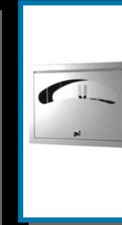
ST 0477 Toilet Seat Cover Dispenser With lock&key, Recessed, S.stell.