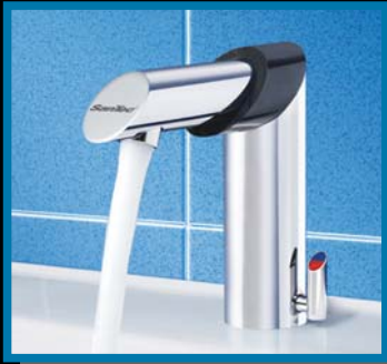
SKY Radar System Tap Singel or with mixer options.