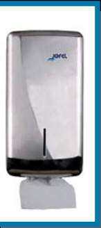
AH 75500 Toilet Tissue Dispenser With lock&key, Stainless stell.