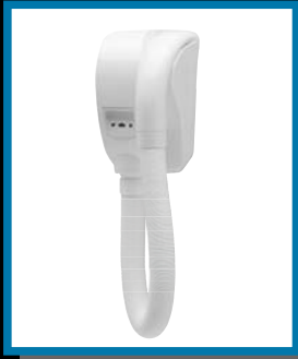
CARAIBE PR Wall-Mounted Hairdryer With shaver socket, 1000w.