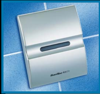
MULTI Automatic Flusing For Urinal Thermoplastic cover, Recessed.