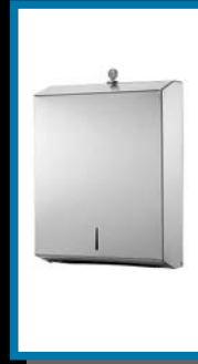
ST 725 Paper Towel Dispenser With lock&key, Stainless stell.