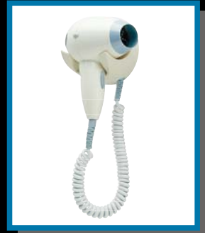
PAGGIO Wall-Mounted Hairdryer 1250w.