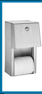
ST 800 K Toilet Tissue Disp. - S.stell, With lock&key, Double roll.