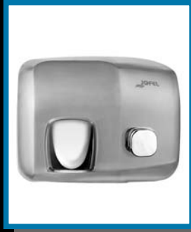
AA 91500 Push Button Hand-Face Dryer Stainless stell cover, Special jet motor, 2000w.