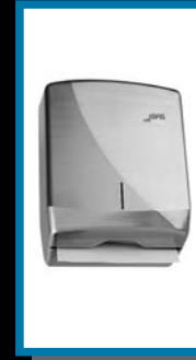
AH 25000 Paper Towel Dispenser With lock&key, Stainless stell.