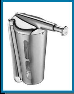
ST 351 Soap Dispenser With lock&key, Stainless Stell.