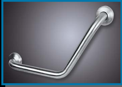
A 501 Angle Grab Bar Stainless stell.