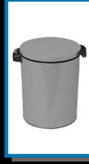
STF 05 A Automatic Waste Receptacle 5 Liter, Stainless stell.