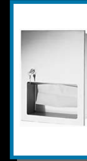
ST 5014 Paper Towel Dispenser With lock&key, Recessed, S.stell.