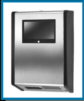
ST 2200 Automatic Hand Dryer Stainless stell cover, LCD screen, 2000w.