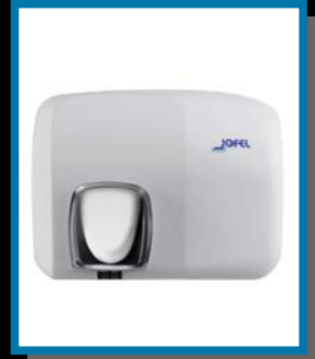
AA 94000 Automatic Hand-Face Dryer Vitrified finish white cover, Special jet motor, 2000w.