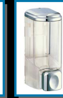
ST 130 S Soap Dispenser With lock&key, Abs plastic chrome plated finish.