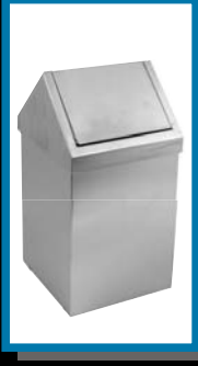
ST 001 Swing Cover Waste Receptacle Surface mounted, Diferent size, Stainless stell.