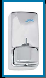
AC 45000 Foam Dispenser With lock&key, Stainless Stell.