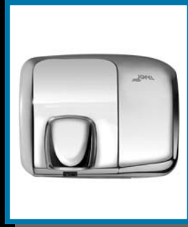
AA 92000 Automatic Hand-Face Dryer Stainless stell cover, Special jet motor, 2000w.