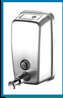
AE 7535 Mini Soap Dispenser With lock&key, Stainless Stell.