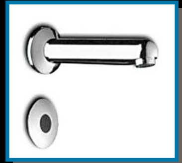
ST 441157 Automatic Tap Wall Mounted.