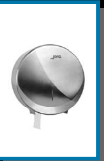
AE 25000 Jumbo Roll Toilet Tissue Disp. With lock&key, ø:220mm., S.stell.