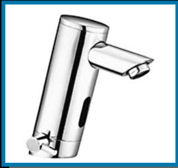
ST 6003 Automatic Tap White mixer.