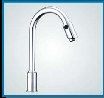
ST 6023 Automatic Tap Double photocell eye Shoulder size 390mm.