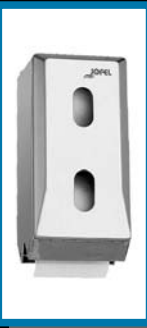
AF 12000 Toilet Tissue Disp. - S.stell, With lock&key, Double roll.