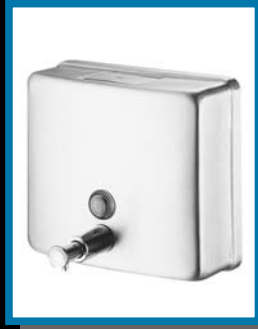
AE 713 Soap Dispenser With lock&key, Stainless Stell.