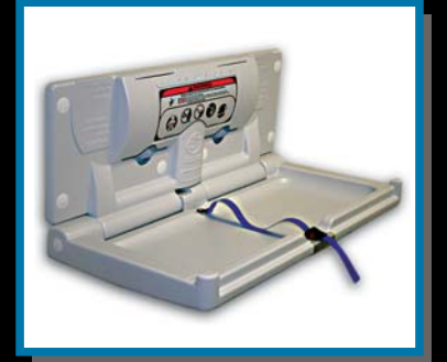
ST 9012 Diaper Changing Stations Paper And Bag Hook, Security Belt, Anti-Bacterial, Abs Plastic.