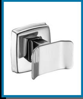
ST 212 Double Hook Stainless stell.