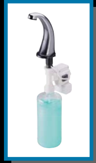
ST 797 Automatic Soap Dispenser Lav-Basin, Abs plastic chrome plated finish.