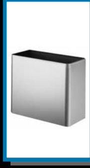
ST 455 Waste Receptacle Surface Mounted, Diferent size, Stainless stell.