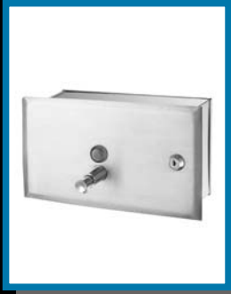
A 600 SA Soap Dispenser With lock&key, Recessed, Stainless Stell.