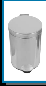
ST 3 Waste Receptacle With Foot Pedal 9 diferent size, Stainless stell.