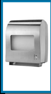
STT 398 Ç Automatic Paper Towel Dispenser With lock&key, Stainless stell.