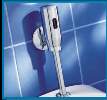
ULTRA Automatic Flusing For Urinal Chrom cover, Surface mounted.