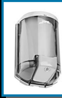
AC 71000 Soap Dispenser With lock&key, Abs plastic body, Stainless stell cover.