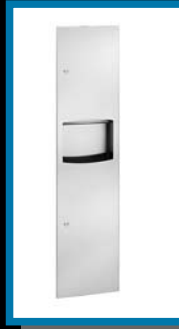
ST 64623 Paper Towel Disp. +Disposal Unit With lock&key, Stainless stell.