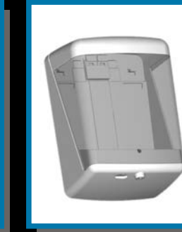
AC 90000 Automatic Soap Dispenser With lock&key, Abs plastic body.