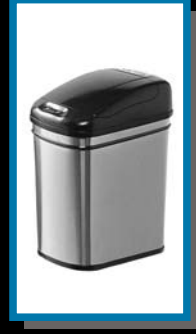
STF 32 Ç Automatic Waste Receptacle Diferent size, Stainless stell.