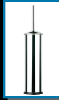
ST 401 Toilet Brush Disp. Stainless stell.