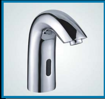
ST 6012 Automatic Tap For cold water.