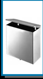
ST 450 K Waste Receptacle With Cover Surface mounted, Diferent size, Stainless stell.