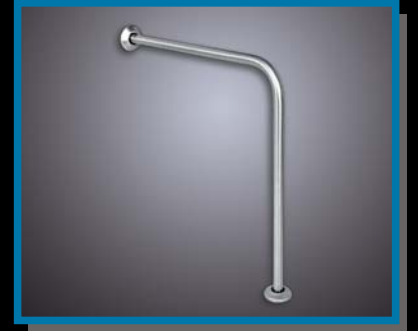
A 503 Floor-Wall Grab Bar Stainless stell.