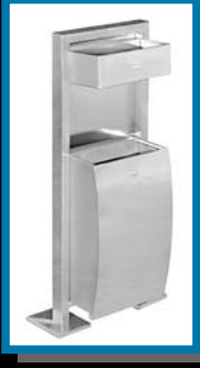
ST P 2007 Waste Receptacle With Ashtray With lock&key, Stainless stell.